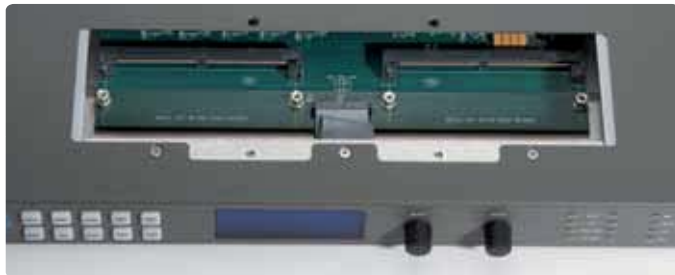
FS2 Expansion Bay for Option Modules